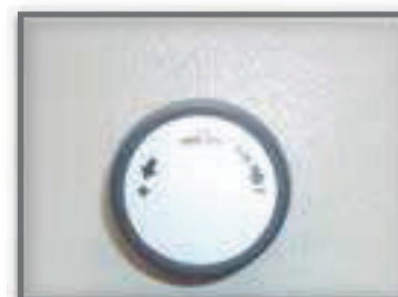
▲ Electronic hand wheel for back-gauge position with variable speed (from very slow to very fast)