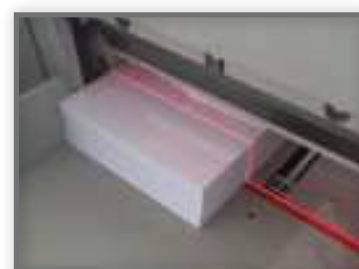
▲ Optical cutting line