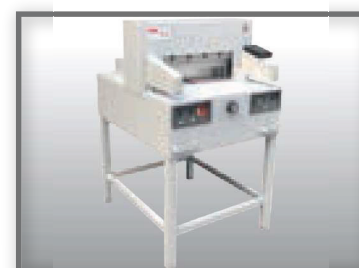
▲ 650EP without side tables