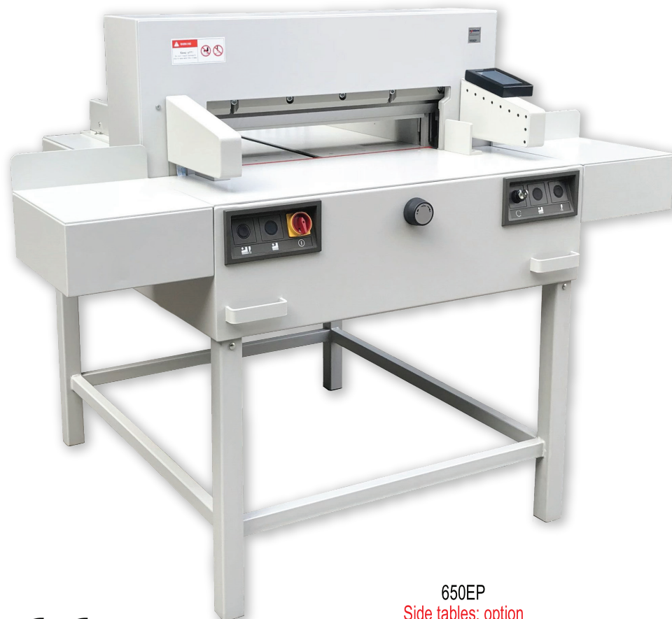
650EP Side tables: option