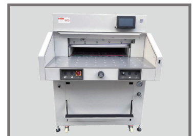
▲ Without side tables