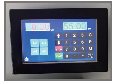
▲ 99 programs with 99 steps each repeat cut function and push out function, touch screen