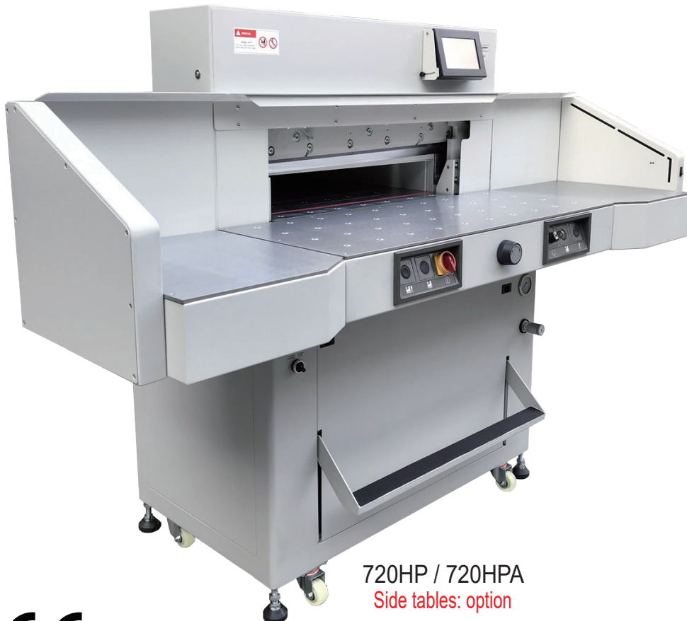
720HP / 720HPA Side tables: option