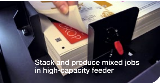
Stack and produce mixed jobs in high-capacity feeder

Averaging under 100W of power consumption, the SC6500 is also possibly the most energy efficient and lowest operating cost cutting solution in it's class. The ability to operate the SC6500 from the 7" touch panel in HELD MODE, with the NO WIRES functionality means this highly mobile device can be easily accommodated in any print shop or manufacturing company that needs to cut lables or die-cut card.