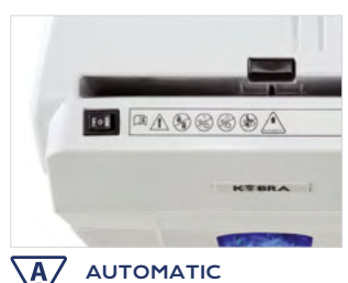
A START & STOP when inserting the material to be shredded.